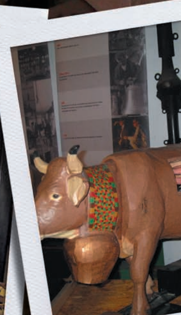
Demonstrating the animated cow: Cllr