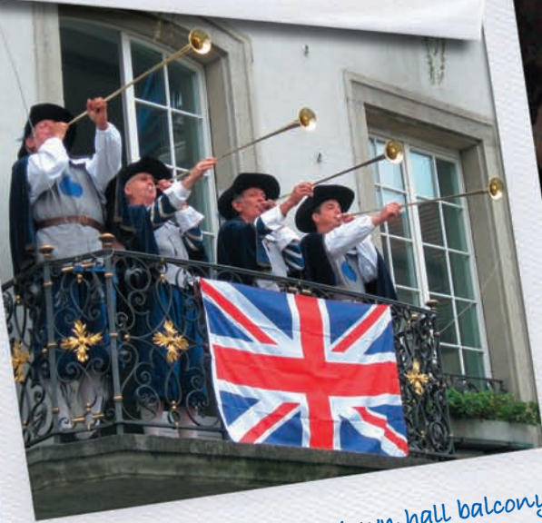
A royal fanfare from the town hall balcony greeting dignitaries from the UK