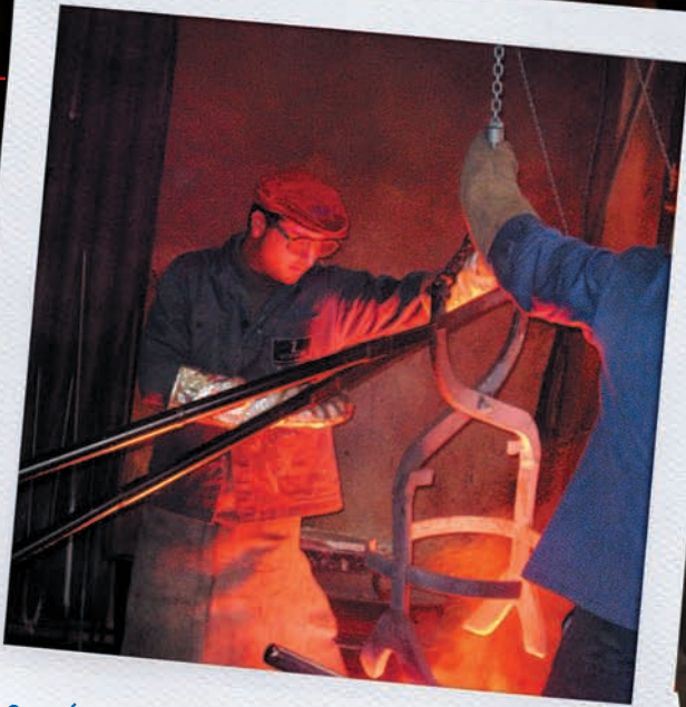
Casting under way in Switzerland's oldest foundry, the Glockengiesserei in Aarau