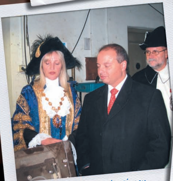
The Lord Mayor with Sir Simon Milton, Deputy Mayor of London in charge of policy and planning