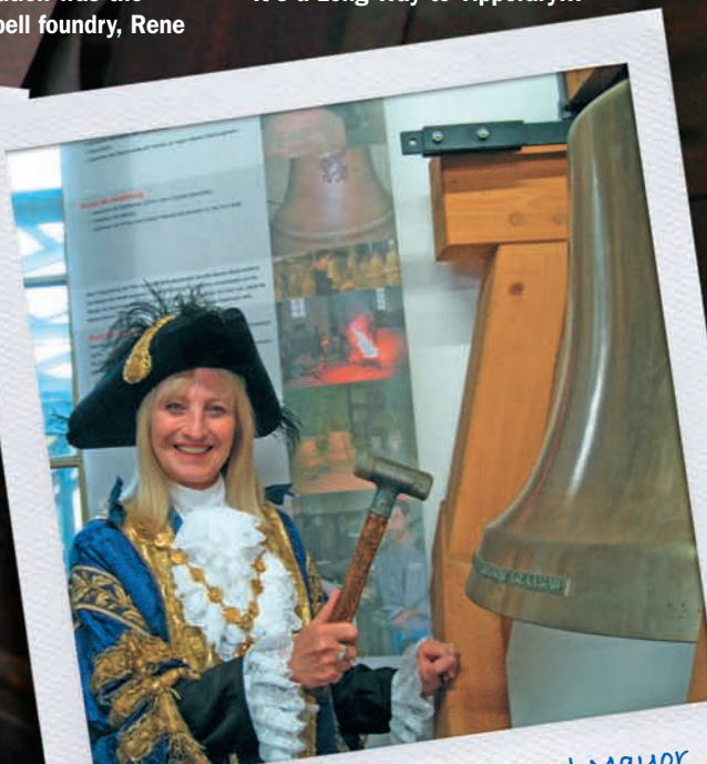
How's this for sound? The Lord Mayor tests one of the refurbished bells