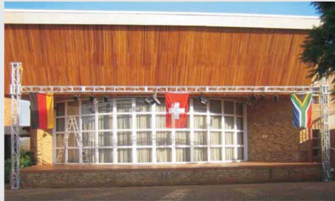
Die neue Lichtenanlage