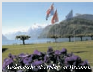
Auslandschweizerplatz at Brunnen

In 1991, on 1 August, Switzerland celebrated the 700th Anniversary of its Foundation by the Solidarity Vow of 1291 between Uri, Schwyz and Unterwalden. There are few if any democracies in the old world, which can emulate the active support and upholding of such a pledge over such a long period of time.