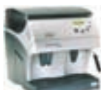
SOLIS Master 5000 Digital, $ 1049.00

SPECIAL OFFER Receive a 5 % discount if you mention offer code CH05 when placing your order.