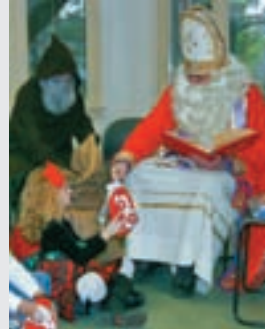
Santa was busy giving encouragements or reproaches to the children but at the end, Schmutzli and he were giving out the long anticipated "Gritibänze", clementines, candies and nuts.

On a sunny Sunday, December 4 th was our family afternoon with Santa Claus at the Jetton Park in Cornelius. Santa was busy giving encouragements or reproaches to the children but at the end, Schmutzli and he were