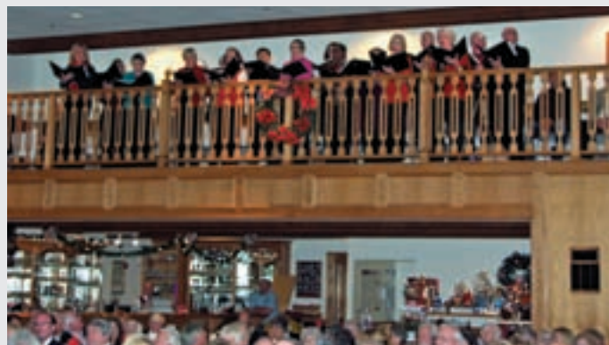
The Corona del Mar Chancel Choir, singing from high above.