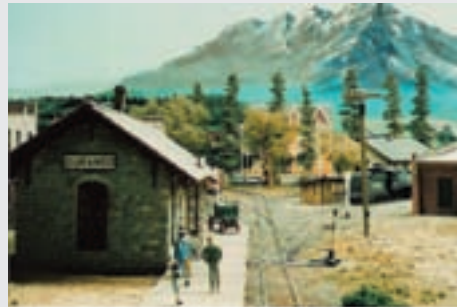
People at the Durango Rail Station

the rails lay silent but most of the landscape was still there. So I took some pictures, and we climbed back up.