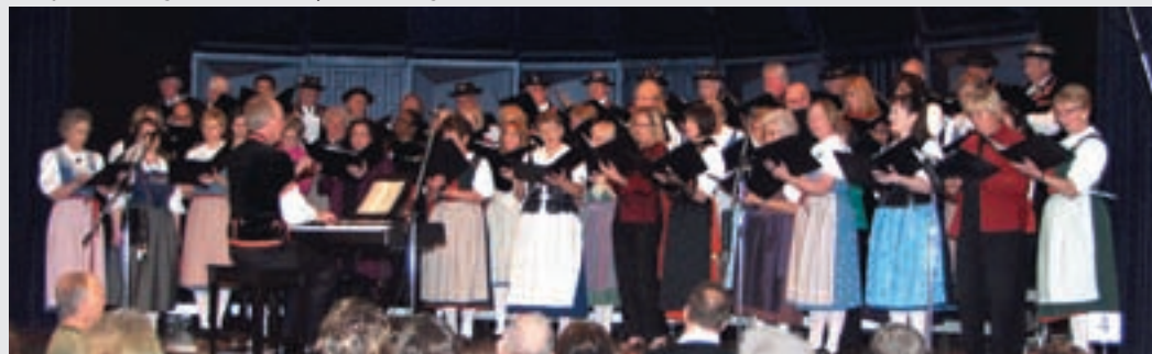
The Chancel Choir and Harmonie squeezed onto the stage for the final song: Händel's Hallelujah from the Messiah.

at www.swissharmonie.com and then click on PERFORMANCES 2011.