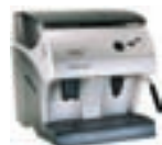
SOLIS Master 5000 $ 899.00

The NEW Palazzo from SOLIS is the ultimate in home espresso machines. It offers: Espresso and Café Crème at the touch of a button; Steam at the turn of a knob; and a built in bypass chute that permits the use of pre-ground coffee (decaf) so that no one is left out. Producing delicious coffeehouse quality lattes and cappuccinos at home has never been so easy.