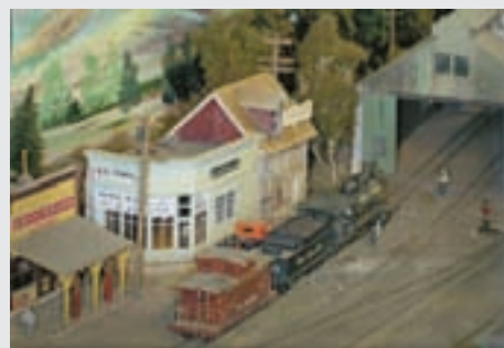
Working on the rail tracks in front of various stores