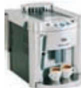
SOLIS Palazzo $ 1199.00

Premiumcoffeemaker by: GULF COAST CONSULTING ENTERPRISES INC. Phone: 941 380 2832 www.premiumcoffeemaker.com support@premiumcoffeemaker.com