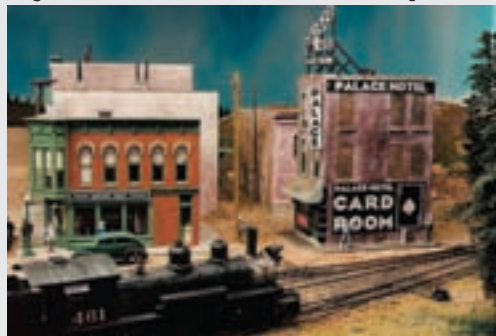
Who wouldn't want to spend some time at the Palace Hotel?

was in the sixties and the cold war was very much on peoples mind. But the basement couldn't have had a more peaceful purpose. Over the years, all three rooms became a railroad wonderland – a miniature of a real railroad that knowledgeable visitors could recognize as based on specific areas in Colorado.