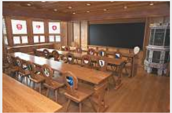
The Swiss Nationality Room at the University of Pittsburgh's Cathedral of Learning.