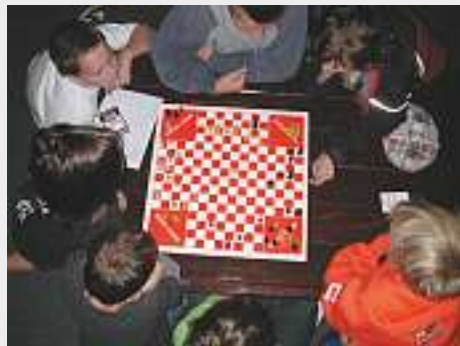
Swiss Chess at SKK

Sponsored by the Portland Swiss Ladies Society, the Swiss Kids Kamp takes place every August at Camp Arrah Wanna near Welches on the way to Mt. Hood. Kampers range in age from 8 years old to 14, with several