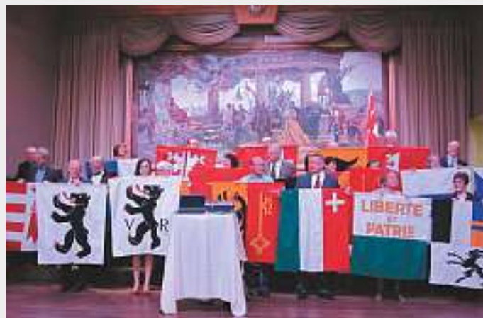
One of the highlights of the evening was the parade of all Swiss Cantonal flags