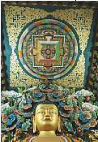
Buddha inside a Bhutanese Temple

In honor of the visit of His Holiness the 14 th Dalai Lama, Tenzin Gyatso, to the University of San Diego, a special photo exhibition of the Buddhist Diaspora