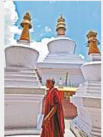
Do-Drul Chorten Stupa In Gangtok

The small and secluded geography of Sikkim makes logical its equation with mythical accounts of a Himalayan utopia known as