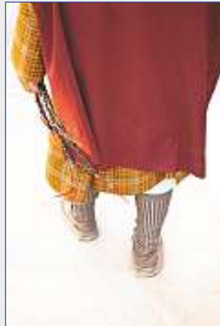
Bhutanese Monk in Mahabodhi Temple in Bodhgaya

Known as the Buddhist "capital" of the world, Bodhgaya in Bihar