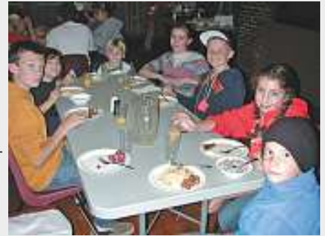
When you are so busy, you are also very hungry!