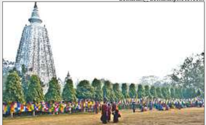
Mahabodhi Temple Bodhgaya