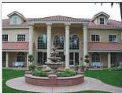
Outside view of the Banquet Hall

On March 24, 2012, 175 members and guests celebrated the 120 th Anniversary with a banquet fit for a king and a queen. Members shared stories of their rich heritage. The evening was full of exhilaration as everyone enjoyed the food, music and atmosphere of Switzerland right smack dab in the middle of town.