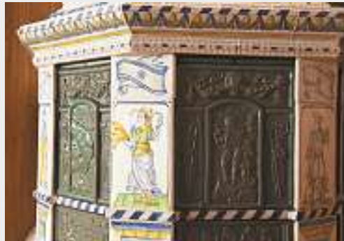
Detail of the room's Kachelofen (tile oven)

Cathedral of Learning. The reception featured a variety of traditional Swiss cookies as well as musical entertainment by Pittsburgh's Helvetia Männerchor and alphorns. Planning for the Swiss Nationality Room began in 1998. The Swiss Room design is inspired by a room from Fraumünster Abbey in Zürich, built in 1489. The classroom features four hand-made trestle tables and 26 "Stabellen" chairs, representing Switzerland's linguistic regions and Cantons (states). Stained-glass windows display the coats-of-arms of Switzerland and its first Cantons. A hand-carved and painted frieze encircles the classroom and includes representations of the flora, fauna, and people of Switzerland. Another special feature of the Swiss Room is a traditional Kachelofen (tile oven).