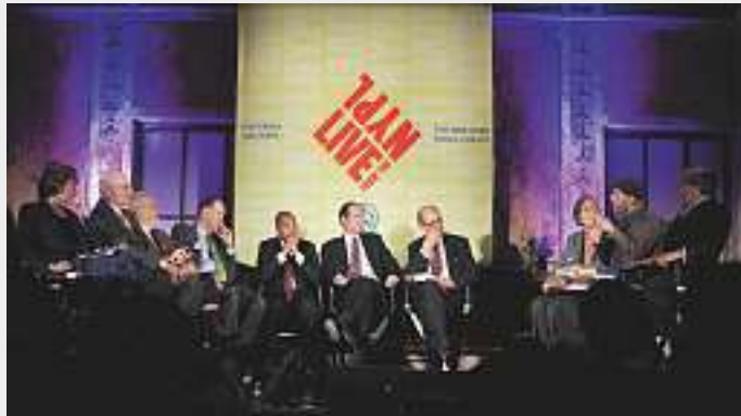
All the panelists from the "Occupy Rousseau" event.

Cross, Reporters Without Borders, the New York University and others to organize a series of events, which highlighted the rich heritage of the Swiss city of Geneva. Building on the 300-year anniversary of the birth of philosopher and writer Jean-Jacques Rousseau, the festival showcased the contemporary relevance of ideas born in Geneva and their impact on current American issues. The festival program brought this message across with different types of events. At several panel discussions the thinking