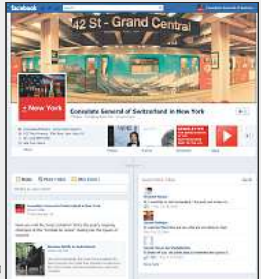
The Facebook page of the Consulate General

adapt to the more casual and conversational "Facebook language" while always keeping a tone representative of the Swiss government. In addition to our Facebook page, we have also launched our own YouTube channel and Twitter account. And with the addition of a social media specialist to our team this April, you can expect many more exciting updates from us in the future. Visit