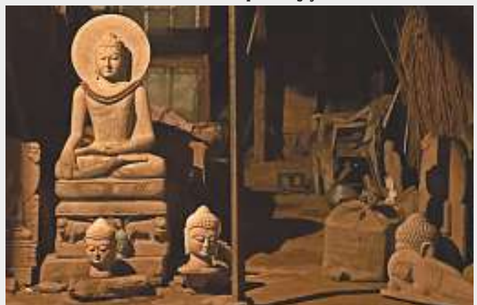
Pala Dynasty Buddhas