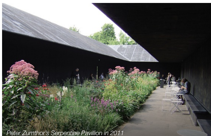
Peter Zumthor's Serpentine Pavilion in 2011

Zumthor was born in Basel in 1943 and trained as a cabinet-maker at