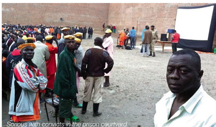
Sorious with convicts in the prison courtyard