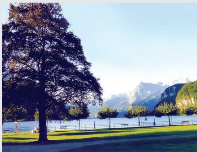
Fighting to retain the value of the Auslandschweizerplatz in Brunnen