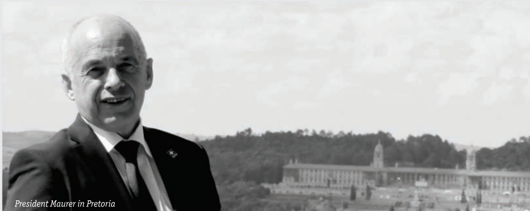
President Maurer in Pretoria