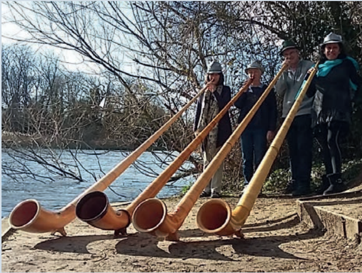
Bring your Alphorn and register by May the 1 st .