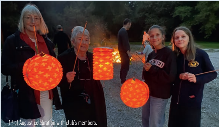
1 st of August celebration with club's members.

For more information, please contact laure.pasteiner@ntlworld.com or margrith@btconnect.com