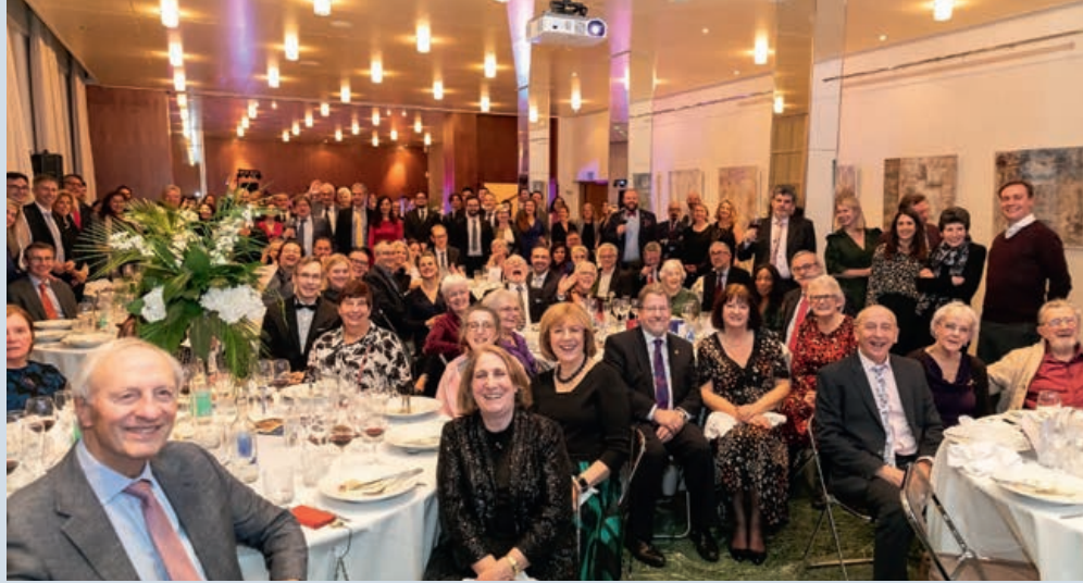
Recreation of the 1903 UT banquet photograph during the gala soiree at the Embassy on the 10 th of February.