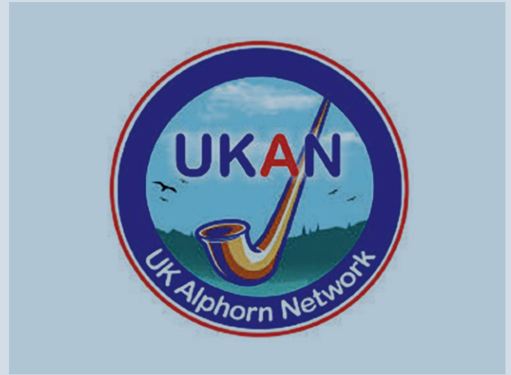
This event promises a day filled with music and friendship.