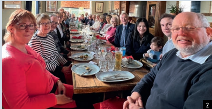
26 adults and 1 child savoured the Club's January lunch.