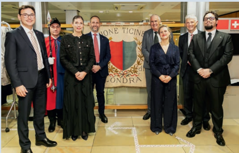
The official delegation of Cantone Ticino.