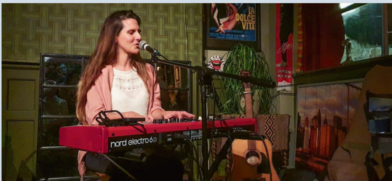
Leti leads song writing circles and advocates for women.