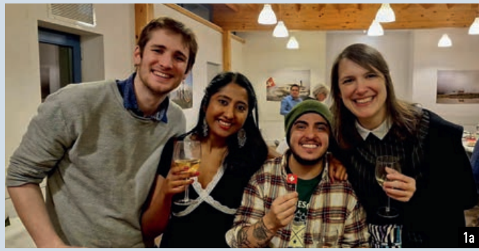
Gathering of members at Lutherhaus in Dublin.

For information about future events, please send an email to swissclubireland@hotmail.com or follow us on Facebook or Instagram.